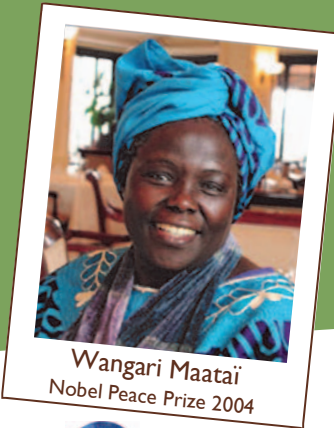
Wangari Maatai Nobel Peace Prize 2004