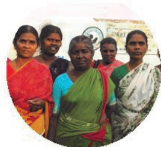
Women's Groups linchpins of development.

Two other Prizes will be awarded: The Prize 'Ensemble Feminine' and the Prize 'Embark Ensemble', each with an allocation of 20,000 Euros and open to compe-