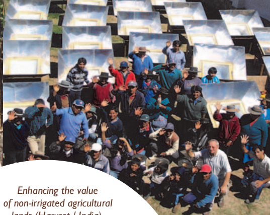
◀ Enhancing the value of non-irrigated agricultural lands (Harvest / India).