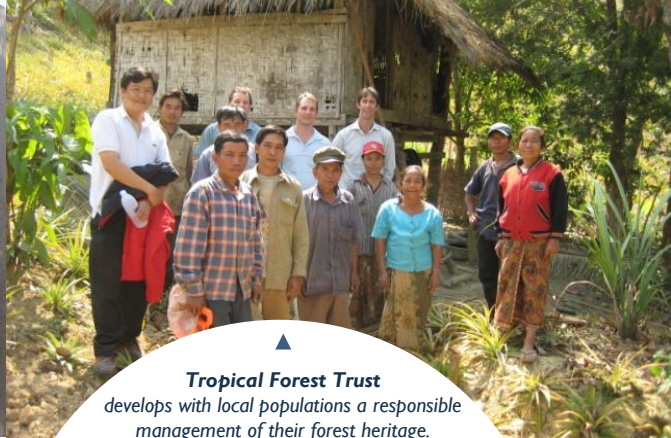
▲ Tropical Forest Trust develops with local populations a responsible management of their forest heritage.