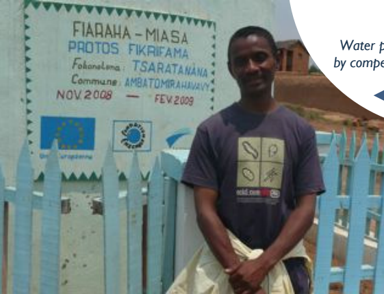
Protos Water payments and pipe maintenance by competent technicians go hand-in-hand (Madagascar)