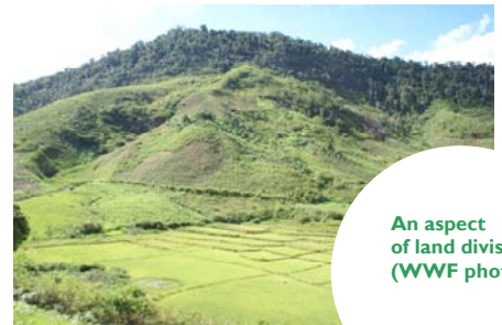
An aspect of land division.

Although the villages seem in agreement to stop the primary forest deforestation, they will only do it if it is profitable for them. Here, this means developing their agricultural production on their existing farmland, and we are fully aware that such agricultural improvements necessitate technical training, irrigation and plantation investments, as well as access to markets. All of this will take longer than a couple of years.