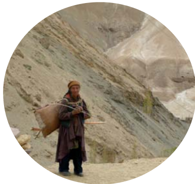
Woman from Ladakh (April/May 2008)