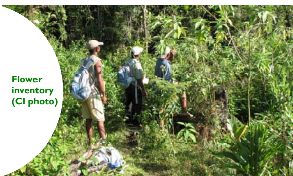
Flower inventory

The two teams know that they must work within a fixed time frame. They have already begun to look for financing to follow on from Fondation Ensemble. The European Union has been approached to support the WWF programme on a more long term basis. CI has already secured financial backing for another two years and is looking for permanent funding. The system should be effective as the sums budgeted for, on average 5 000 dollars per village, per year, seem sufficient to motivate the extremely poor and isolated villagers.