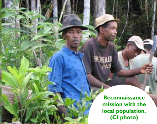
Reconnaissance mission with the local population.