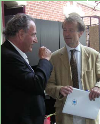
At the annual lunch of the Foundation's College of Experts. These informal meetings attribute particular importance to friendly exchanges.