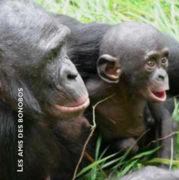
LES AMIS DES BONOBO