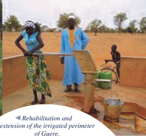
Rehabilitation and extension of the irrigated perimeter of Guere.