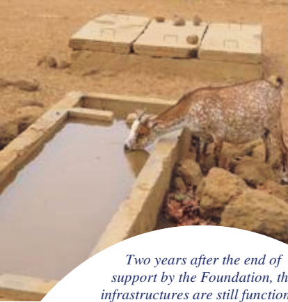
Two years after the end of support by the Foundation, the infrastructures are still functional.