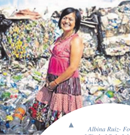
▲ Albina Ruiz- Founder of Ciudad Saludable (Peru)

'We can still change the world. But to succeed in this formidable challenge, we shall have to be creative, invent new models and accept our differences in order to focus on what unites us. That depends only on us, on the ability of each of us to realize that we can each become an agent for change and to believe that Ensemble (together), everything becomes possible'.