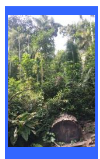
Get more information on the program supported by Fondation Ensemble: