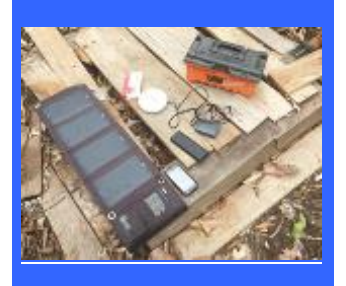
Technology to save Amazonian Forest (Animation)