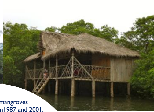
70% of Ecuador's mangroves were destroyed between 1987 and 2001.