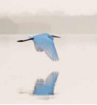
In Basse-Casamance, certain ancestral beliefs have been revived and modernized to protect the mangroves.