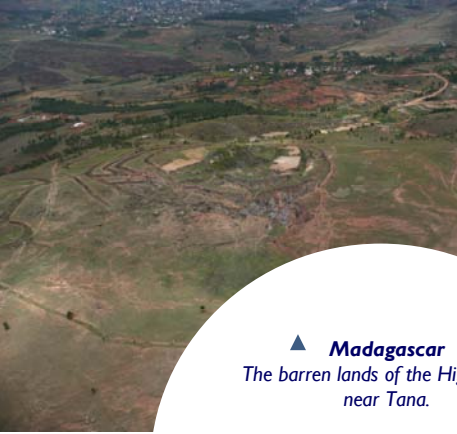
▲ Madagascar The barren lands of the High Plains near Tana.

300 year old Rosewood. Primary forests in Madagascar originally covered 80 to 100 % of the island.