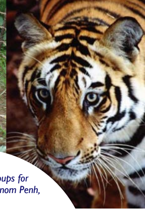
▲ Poh Kao There may be only 3,000 tigers left in the wild, compared to 100,000 in 1900. Cambodia.