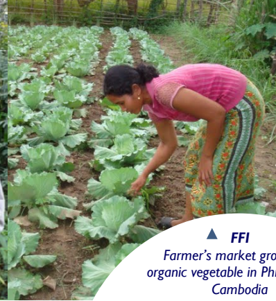
▲ FFI Farmer's market groups for organic vegetable in Phnom Penh, Cambodia