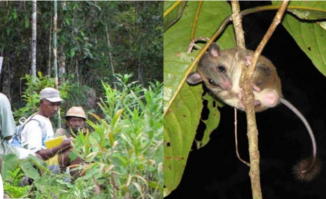
Reconnaissance mission with the local population.