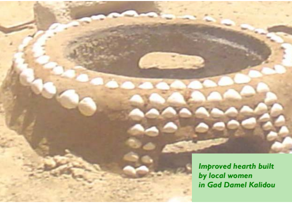
Improved hearth built by local women in Gad Damei Kalidou