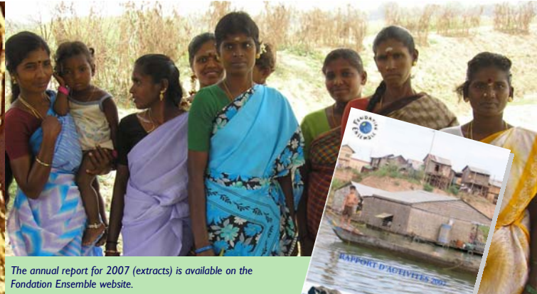
The annual report for 2007 (extracts) is available on the Fondation Ensemble website.