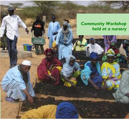
Community Workshop held at a nursery