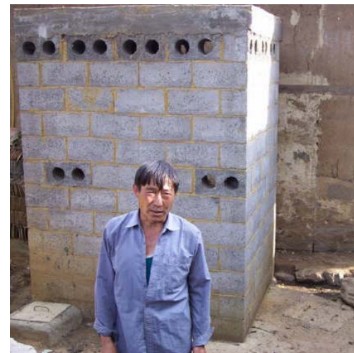
See technical report entitled 'biogas in China'.

A project report is also available on www.fondationensemble.org