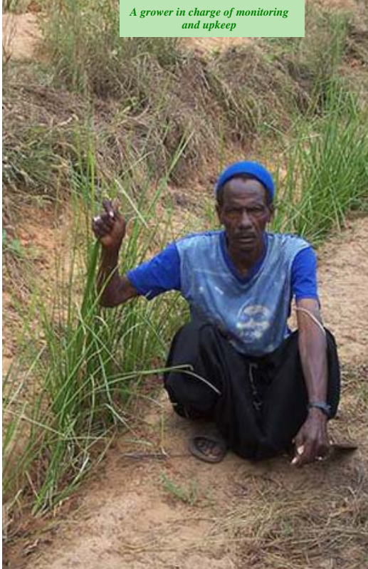
A grower in charge of monitoring and upkeep

To find out more: www.sossahel.org A project report is also available on www.fondationensemble.org