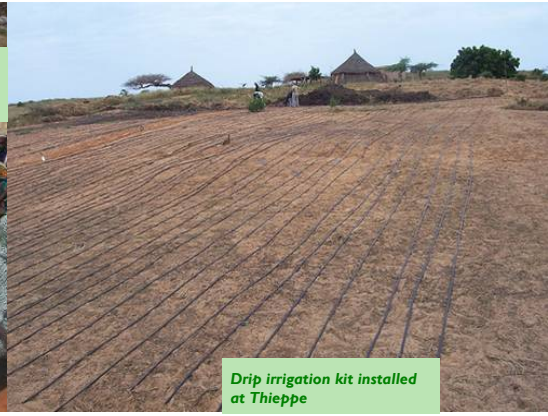
Drip irrigation kit installed at Thieppe